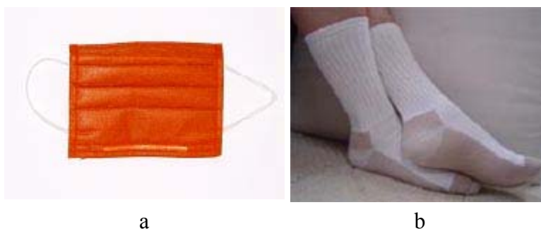
Figure 3. a) Antiviral non-woven mask containing 3% copper impregnated polypropylene fibers (w/w). b) Antifungal and antibacterial socks that cure athlete's foot. These socks received the approval of the American Podiatric Medical Association. The soles of the socks contain 12% copper impregnated polyester fibers with 1% (w/w) copper oxide content.

Utilizing the properties of copper, two durable platform technologies were developed: the first one plates cotton fibers with copper oxide and the second one impregnates polyester, polypropylene, polyethylene, polyurethane, polyolefin, or nylon fibers with copper oxide. Both technologies endow the fibers with potent broad-spectrum anti-bacterial, anti-viral, anti-fungal and anti-mite properties (3,4). These copper oxide-treated fibers are then readily introduced into the mass production of woven, knits and non-woven fabrics with no requirement for alteration of industrial procedures or machinery.